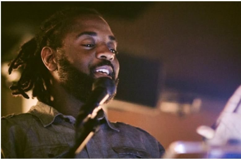
Reginald Dwayne Betts