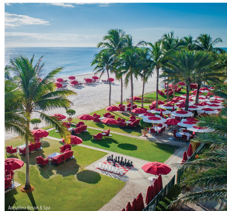
Acqualina Resort & Spa