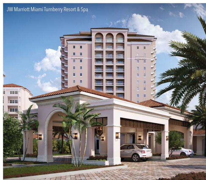
JW Marriott Miami Turnberry Resort & Spa

19999 W. Country Club Dr., Aventura; 305.932.6200; jwturnberry.com