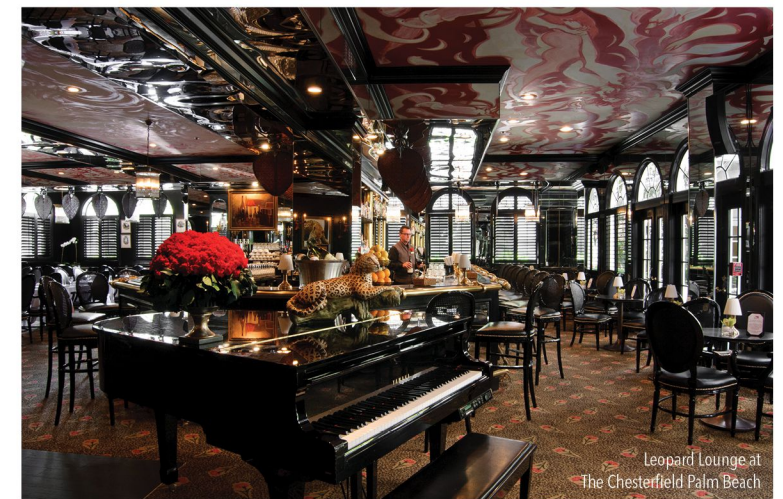
Leopard Lounge at The Chesterfield Palm Beach

363 Coconut Row, Palm Beach; 561.659.5800; chesterfieldpb.com