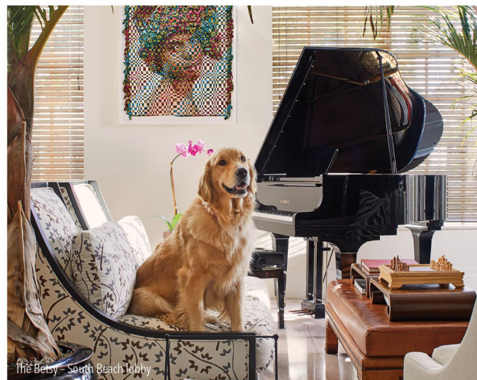
The Betsy - South Beach lobby

1440 Ocean Drive, Miami Beach; 305.531.6100; thebetsyhotel.com